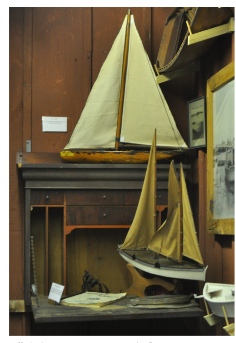
Wall desk, H. L. Harvey Fish Company