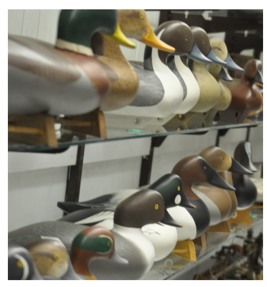
Just a few of the decoys on display

A dedicated group of members of the Cecil-Harford Hunters Association, founded in 1950, envisioned the museum in the early 1970s.