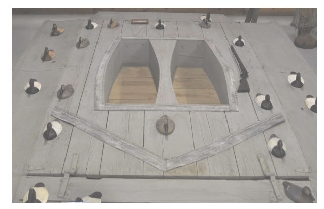
Rare double sinkbox

To preserve the lifestyle of the commercial waterman and hunter of the Upper Chesapeake Bay.